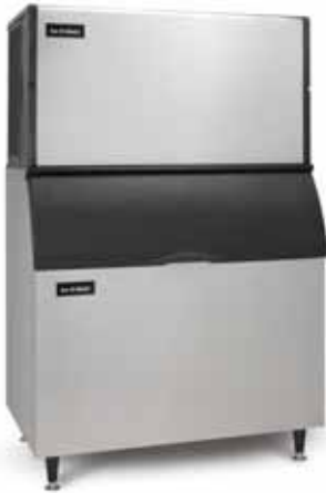
ICE1406 on B100